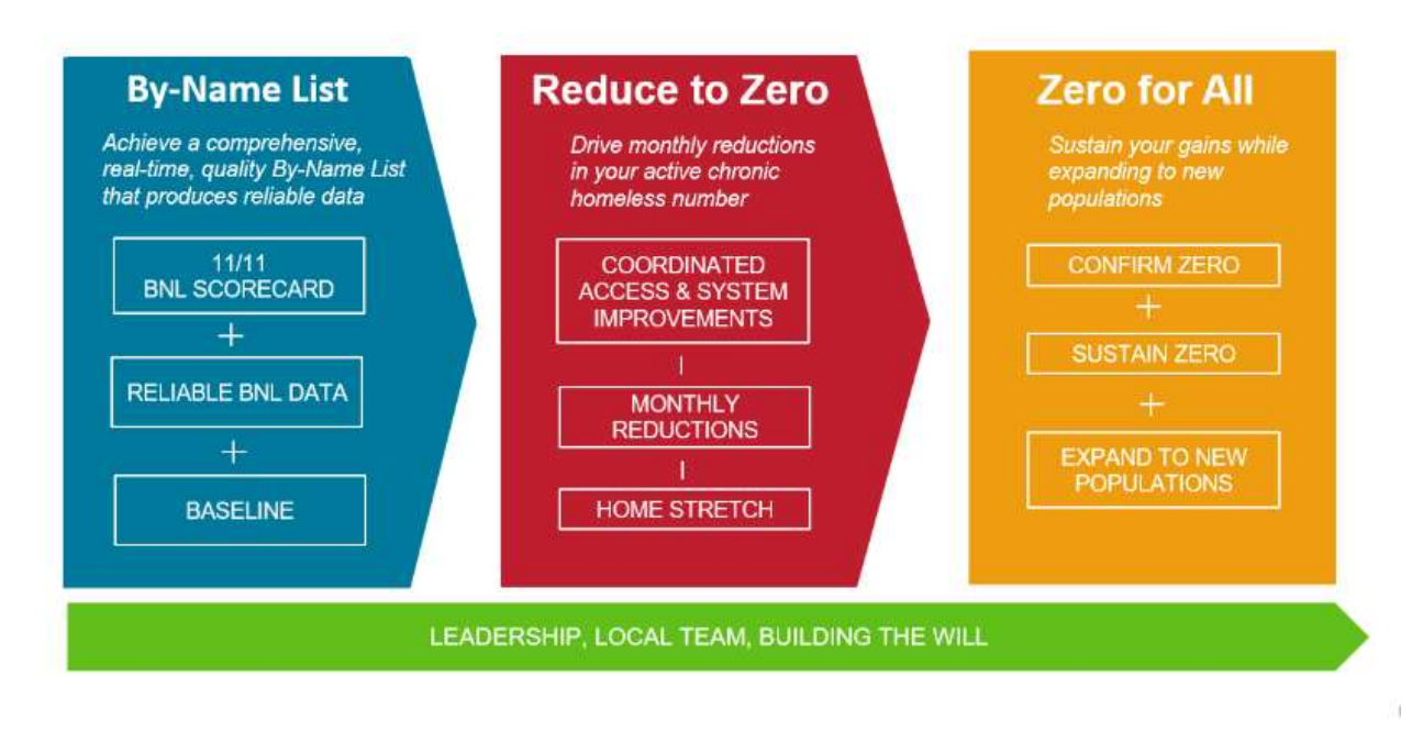
Figure 1: Built for Zero Canada Cohorts

Built for Zero Canada (BFZ-C) communities work through a series of milestones within cohorts on their journey to achieving chronic functional zero. Once a community has achieved a Basic Quality By-Name List (QBNL) and set their baseline month (see document on BNL), they transition from the 'BNL cohort' to the 'reduce cohort' (see Figure 1).